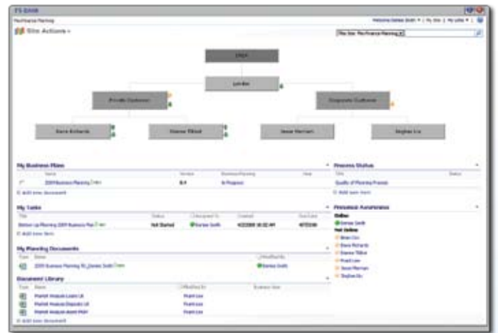
Flexible methods to plan the financial year consistently